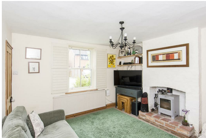
Timber double-glazed sash window to front and double-glazed windows to the rear with plantation shutters. Multi fuel burning stove fire. Radiator.