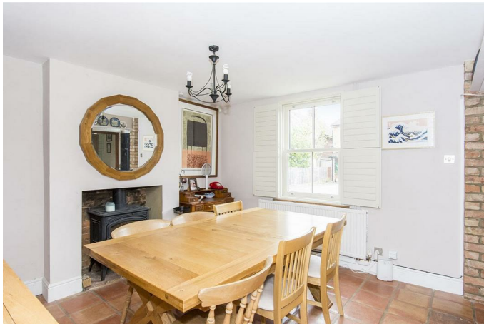
Main front entrance door. Timber double-glazed sash window to front. Multi fuel burning stove fire. Tiled floor. Radiator.