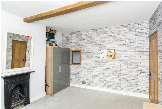
Bedroom Three 12'6" x 11'5" (3.81m x 3.48m)