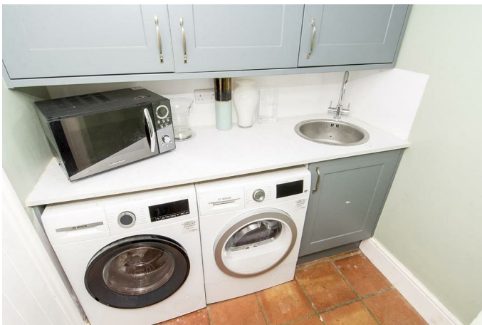
Utility Room 6'0" x 4'9" (1.83m x 1.45m )

Space and plumbing for washing machine and dryer. Fitted range of wall and floor mounted units. Stainless steel sink. Tiled floor.