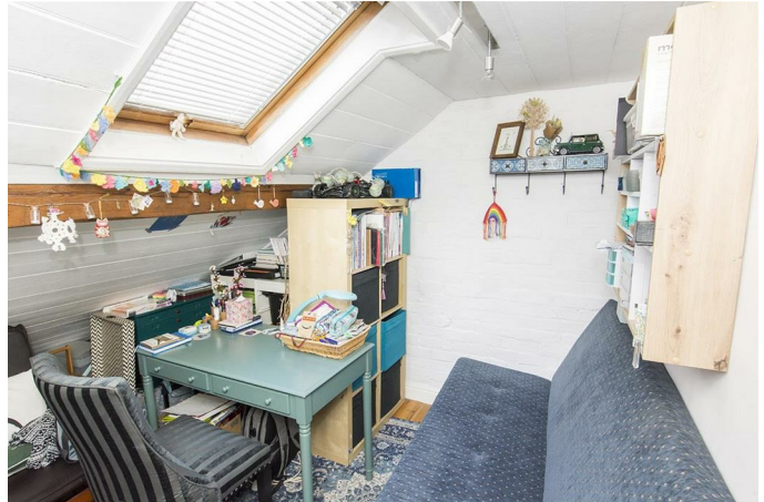
Double-glazed skylight. Radiator.